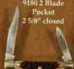
9180 2 Blade Pocket 2 5/8" closed