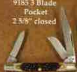
9185 3 Blade Pocket 2 5/8" closed