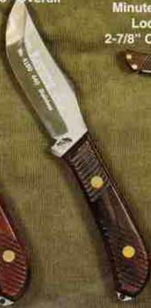
8445 - Minuteman Lock 2-7/8" Closed