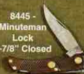
8445 - Minuteman Lock 2-7/8" Closed