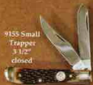
9155 Small Trapper 3 1/2" closed