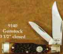
9140 Gunstock 3 1/2" closed