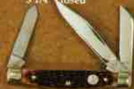
9115 Serpentine 3 1/4" closed