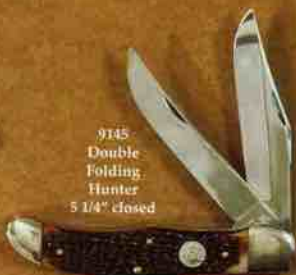
9145 Double Folding Hunter 5 1/4" closed