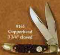
9165 Copperhead 3 3/4" closed