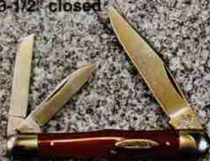
PCR3 Whittler 3-1/2" closed