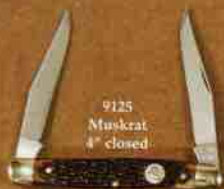
9125 Muskrat 4" closed