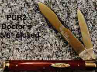
PCR2 Doctor's 3-5/8" closed