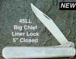
45LL Big Chief Liner Lock 5" Closed