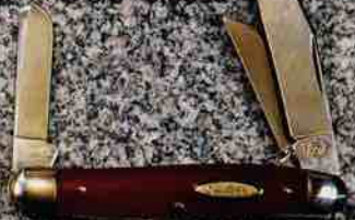
PCR5 Stockman 3-5/8" closed