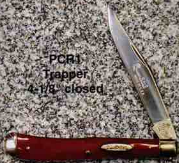
PCR1 Trapper 4-1/8" closed