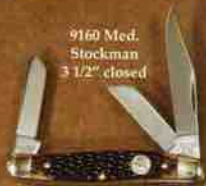
9160 Med. Stockman 3 1/2" closed