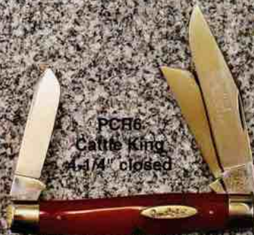
PCR6 Cattle King 4-1/4" closed