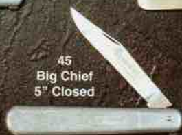
45 Big Chief 5" Closed