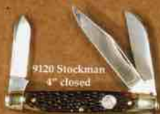
9120 Stockman 4" closed