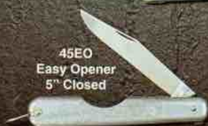
45EO Easy Opener 5" Closed