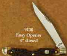
9130 Easy Opener 4" closed