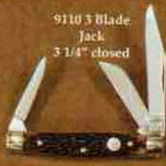
9110 3 Blade Jack 3 1/4" closed