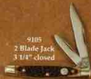
9105 2 Blade Jack 3 1/4" closed