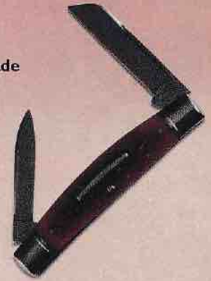
5500 Two Blade Congress