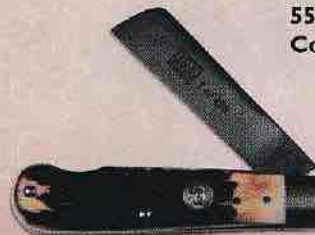
5500 Easy Open Cotton Sampler

Medium Easy Open Cotton Sampler 4" Closed Pattern #J.P.2-C